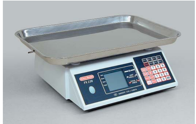
above: optional produce/fish tray left: optional customer tower